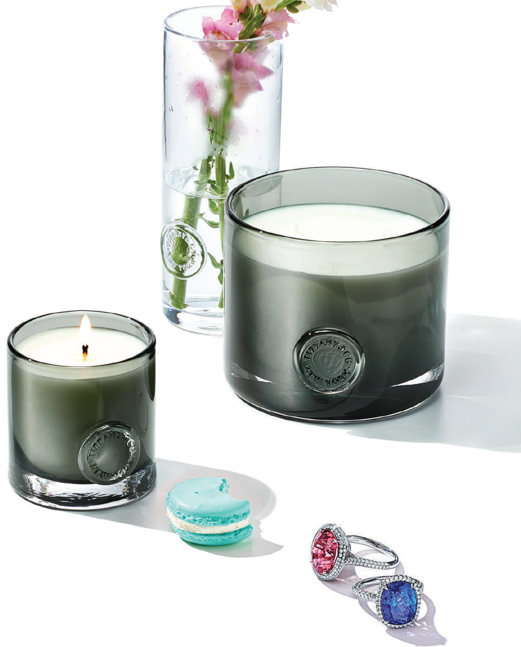
Right: Tiffany Seal candles in gray mouth-blown crystal glass vessel; Tiffany Seal vase; Ring in platinum with a pink tourmaline of 8 carats and diamonds and ring in platinum with a tanzanite of over 8 carats and diamonds.