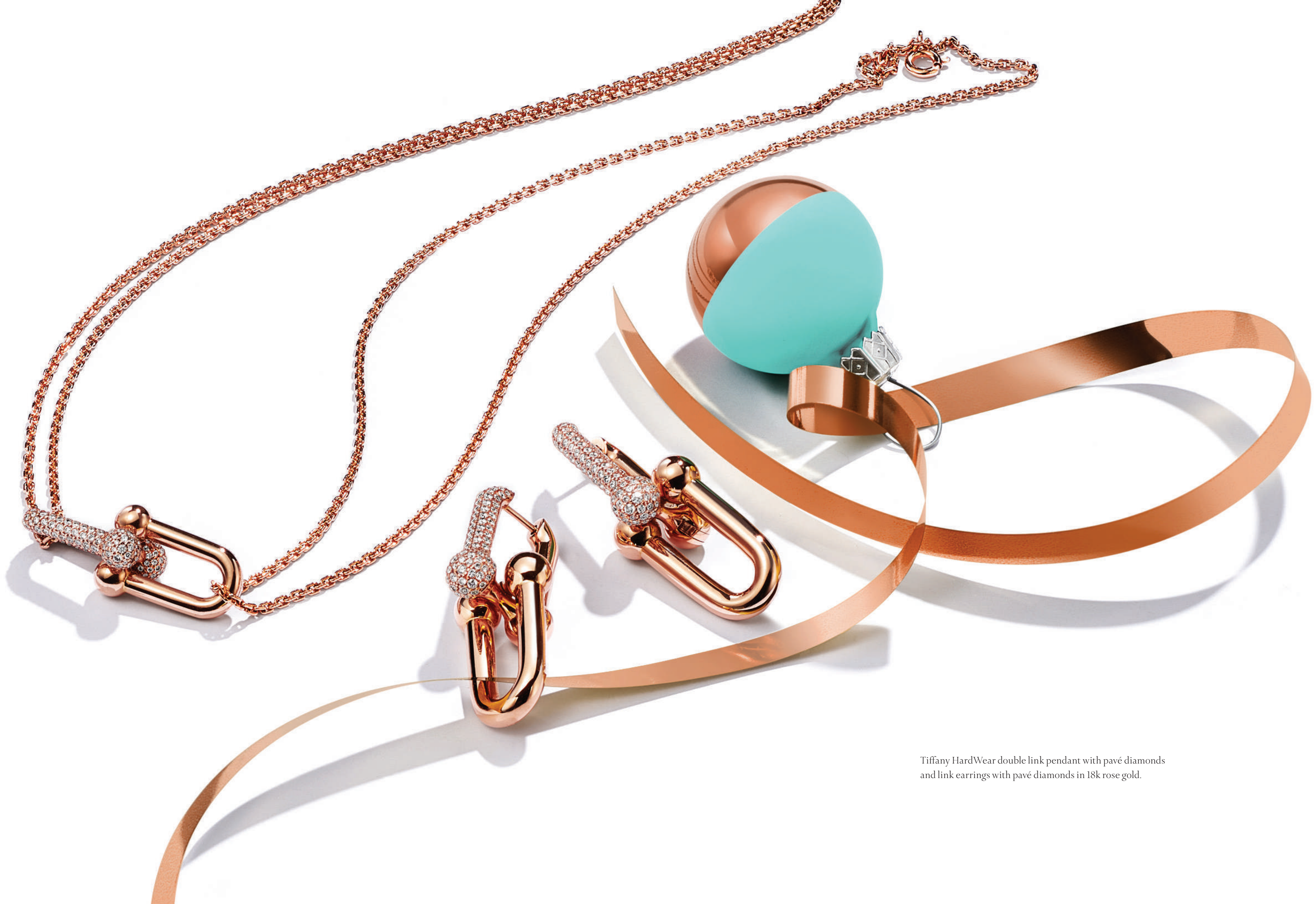
Tiffany HardWear double link pendant with pavé diamonds and link earrings with pavé diamonds in 18k rose gold.