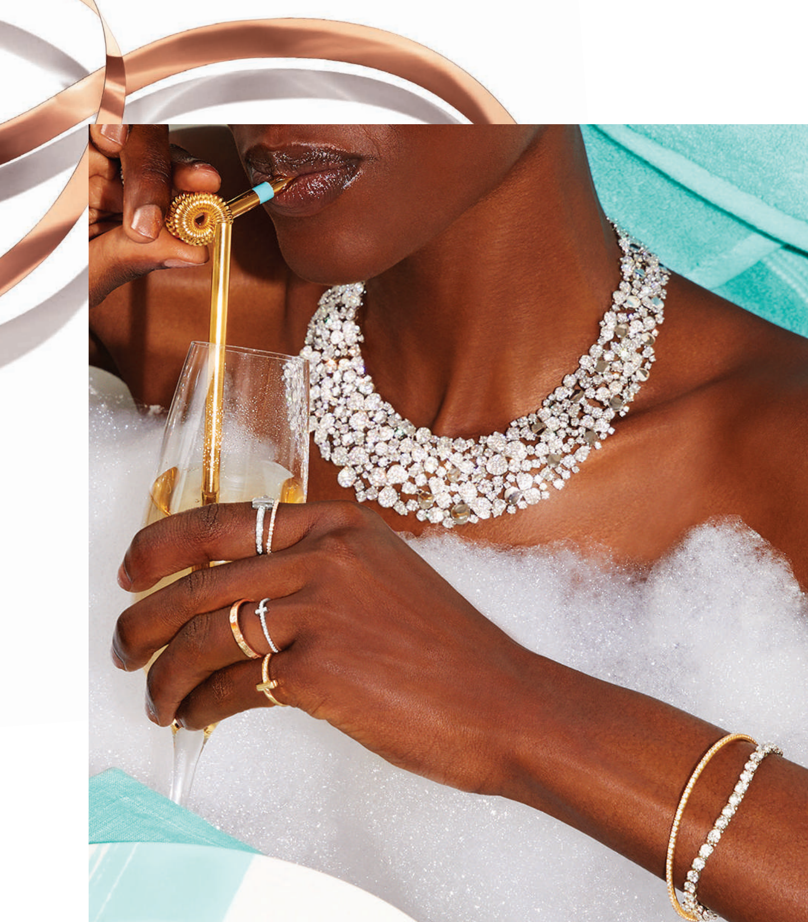
Left: Tiffany Paper Flowers® necklace in platinum with diamonds; Tiffany T1 rings with diamonds in 18k yellow and white gold; Everyday Objects gold vermeil crazy straw; Tiffany Victoria® tennis bracelet in platinum with diamonds and diamond vine earrings in platinum; Tiffany Metro bangle in 18k gold with diamonds; Tiffany & Co.® band ring in 18k rose gold; Tiffany Soleste® band ring in 18k rose gold; Tiffany Brushstroke dessert plate; Champagne flute.