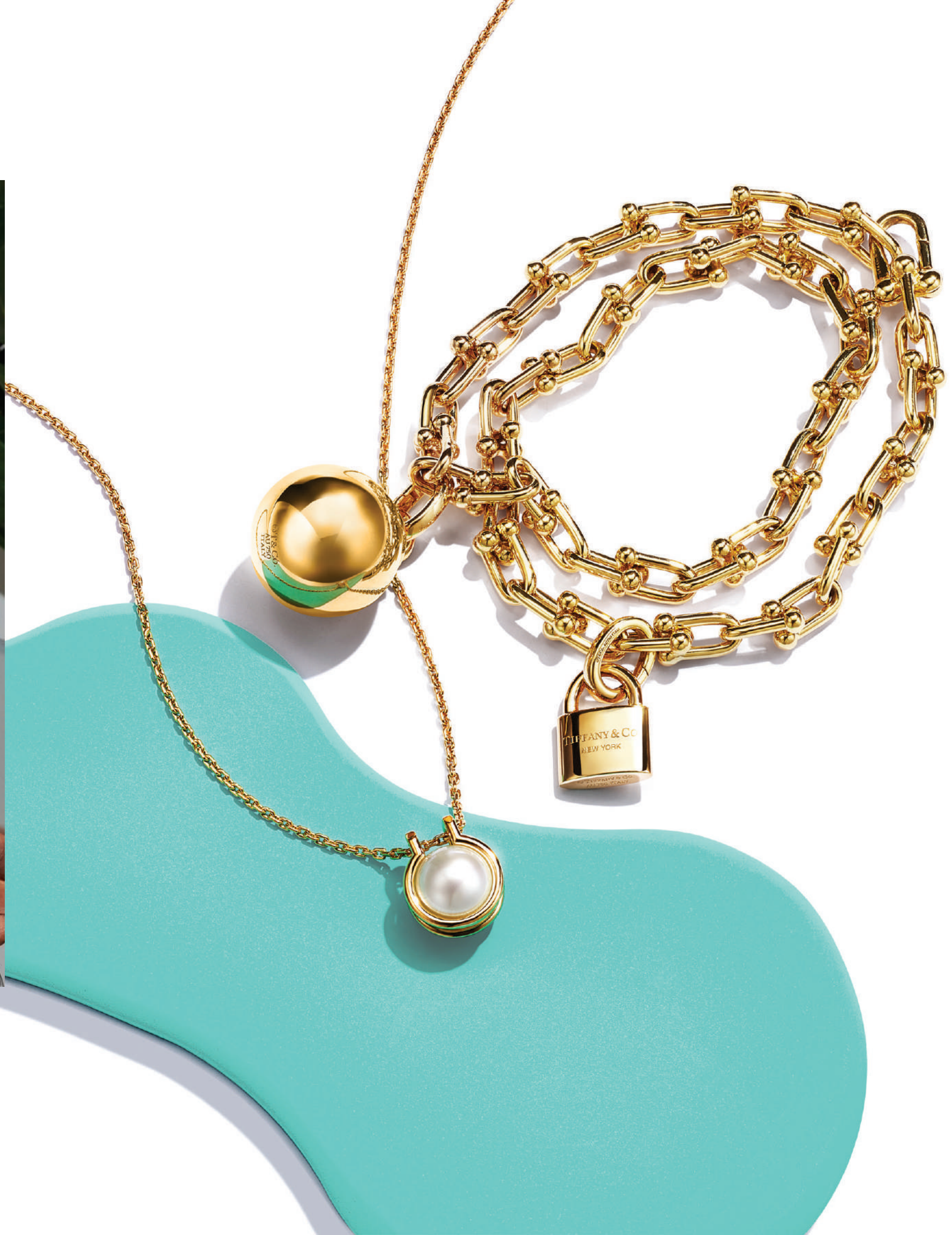
Right: Tiffany HardWear wrap bracelet and South Sea pearl link pendant in 18k gold.