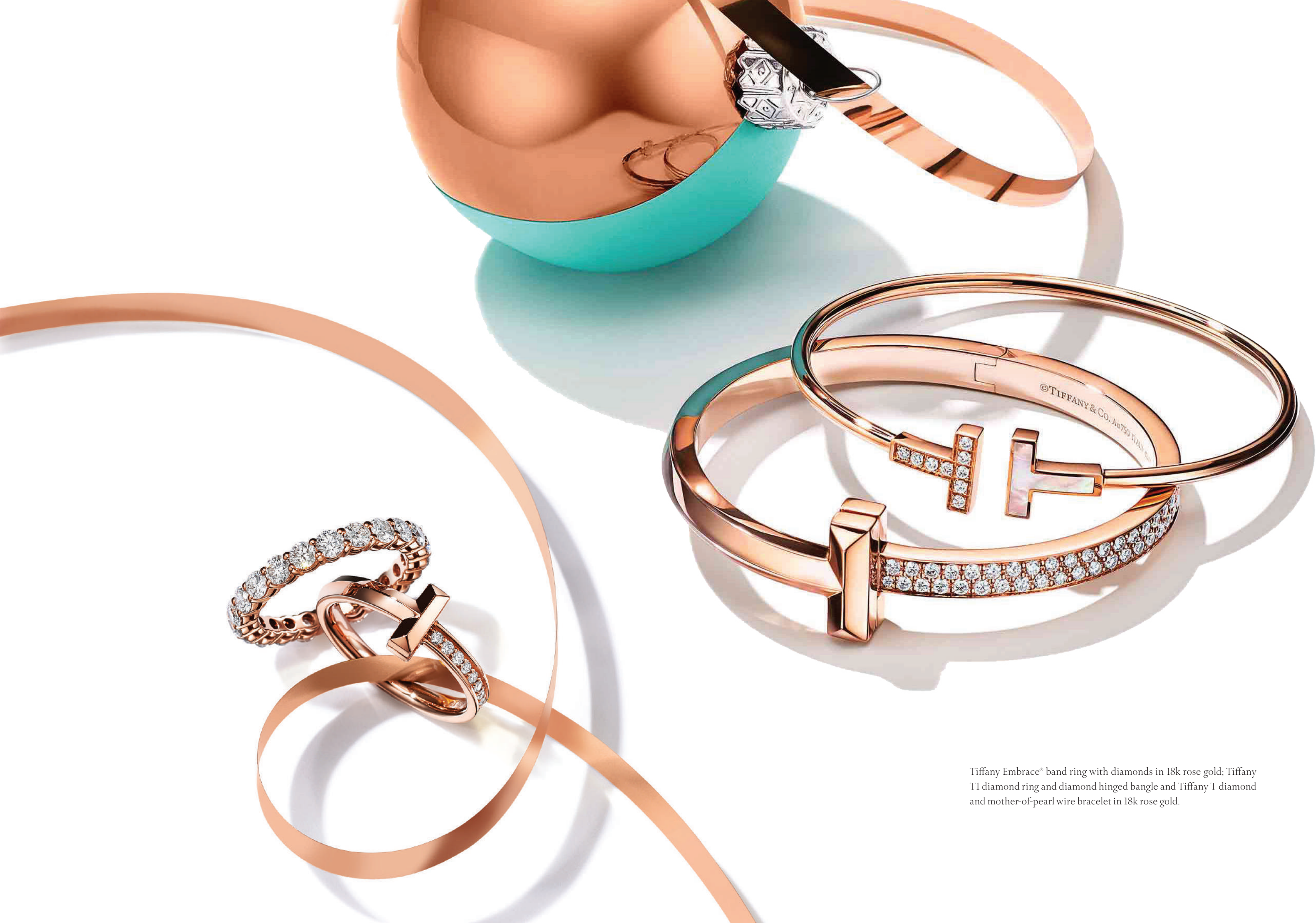
Tiffany Embrace® band ring with diamonds in 18k rose gold; Tiffany T1 diamond ring and diamond hinged bangle and Tiffany T diamond and mother-of-pearl wire bracelet in 18k rose gold.