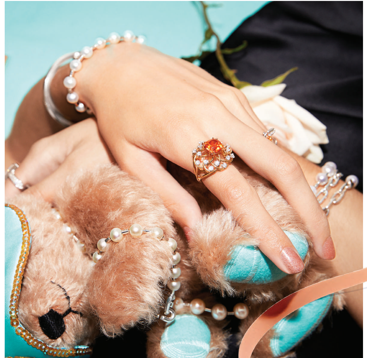
Left: Tiffany HardWear freshwater pearl lock bracelet and freshwater pearl ring.