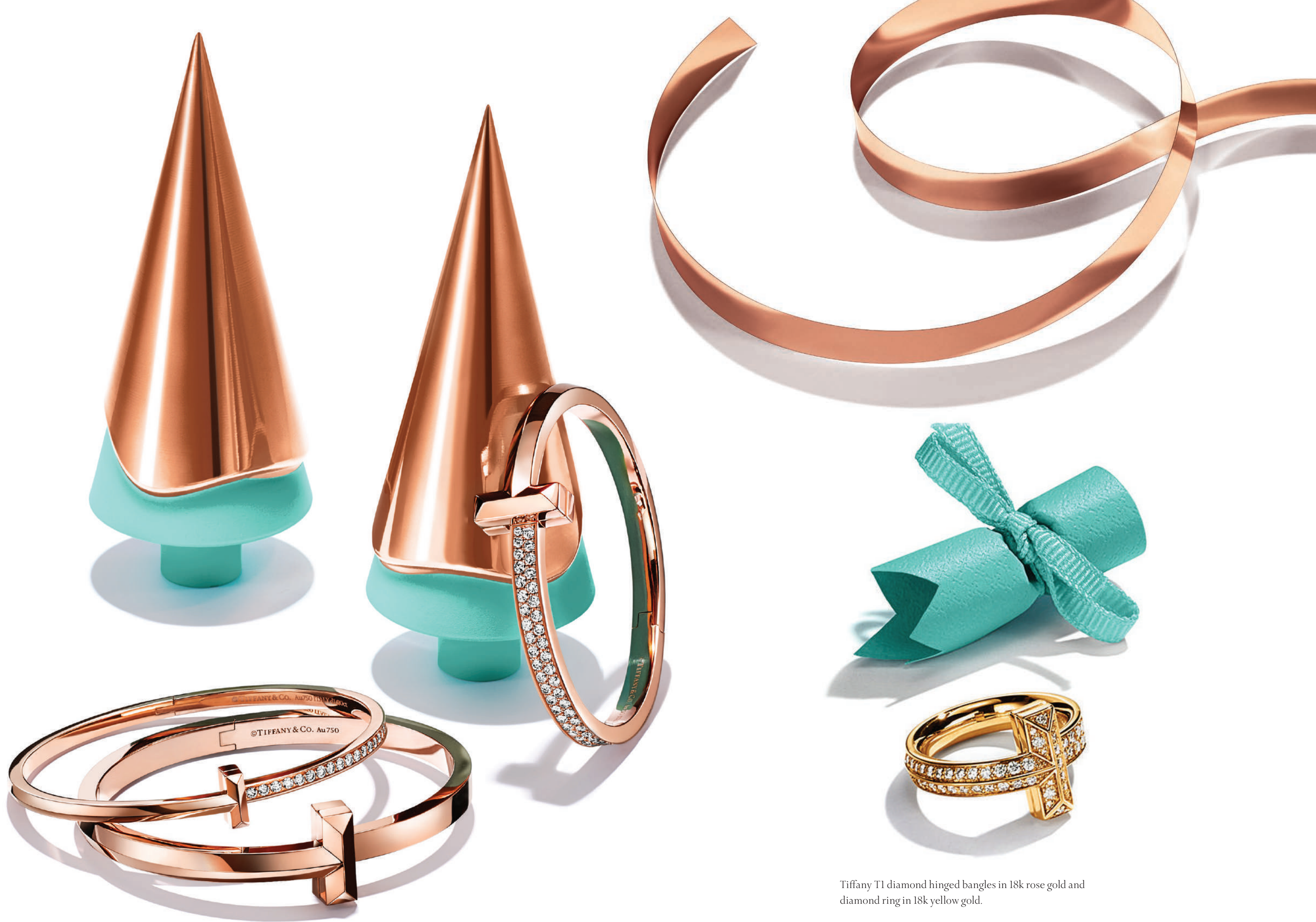
Tiffany T1 diamond hinged bangles in 18k rose gold and diamond ring in 18k yellow gold.