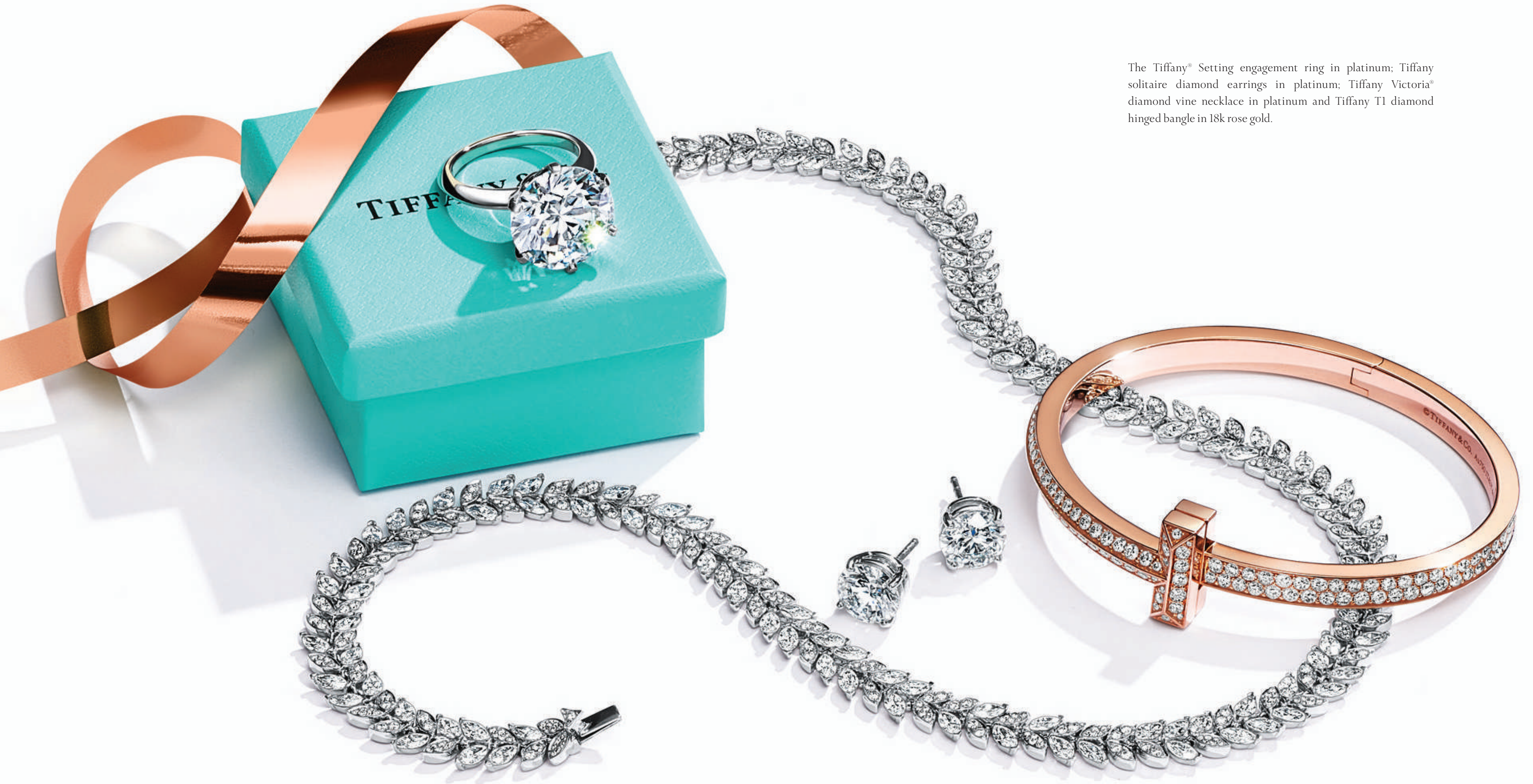
The Tiffany® Setting engagement ring in platinum; Tiffany solitaire diamond earrings in platinum; Tiffany Victoria® diamond vine necklace in platinum and Tiffany T1 diamond hinged bangle in 18k rose gold.