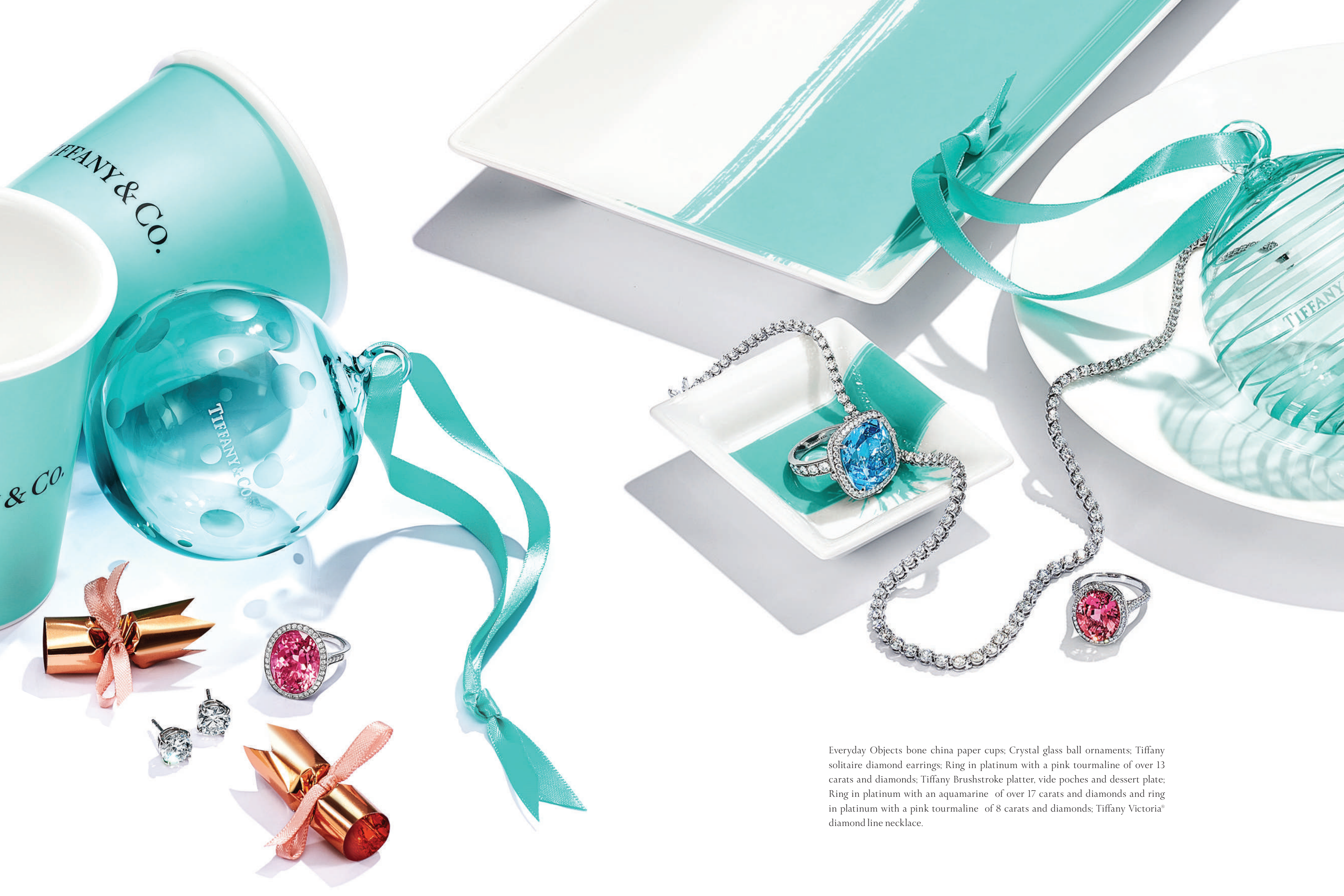
Everyday Objects bone china paper cups; Crystal glass ball ornaments; Tiffany solitaire diamond earrings; Ring in platinum with a pink tourmaline of over 13 carats and diamonds; Tiffany Brushstroke platter, vide poches and dessert plate; Ring in platinum with an aquamarine of over 17 carats and diamonds and ring in platinum with a pink tourmaline of 8 carats and diamonds; Tiffany Victoria® diamond line necklace.