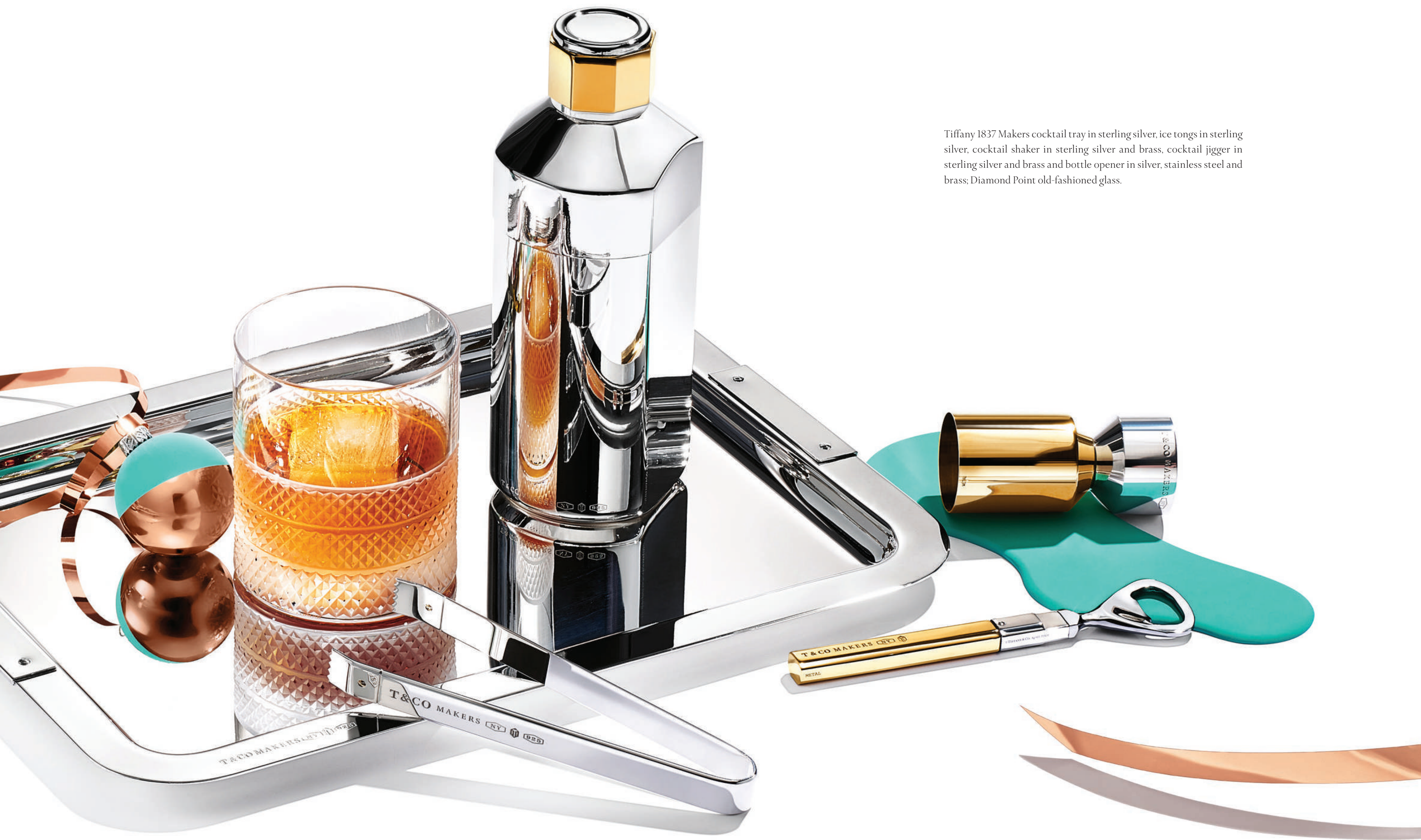
Tiffany 1837 Makers cocktail tray in sterling silver, ice tongs in sterling silver, cocktail shaker in sterling silver and brass, cocktail jigger in sterling silver and brass and bottle opener in silver, stainless steel and brass; Diamond Point old-fashioned glass.